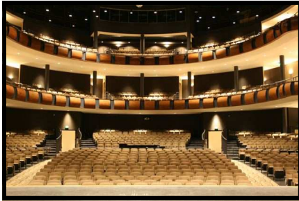
Ellen Ewing Performing Arts Center

free celebration concert for Saline High School's Ellen Ewing Performing Arts Center. "This event is our way of thanking the Saline community for their generous support of our theater and will also demonstrate