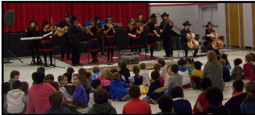
FRS performs at Dearborn Heights Montessori Center

that when the event coordinator decided to move up the entertainment schedule due to worsening weather conditions, his introduction of FRS caught them momentarily off-guard. Two hundred people turned to the back of the room expecting, no doubt, to see musicians with instruments in hand. Instead, they saw 15 dedicated high school students, busy working on their homework! Everyone smiled and applauded as ReStrung members quickly scrambled to put away their books and tune their instruments. They were on stage within minutes, making it a notable evening for all involved.