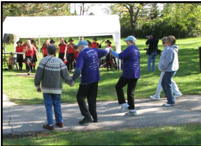
Some people just can't help dancing along with FRS cloggers....