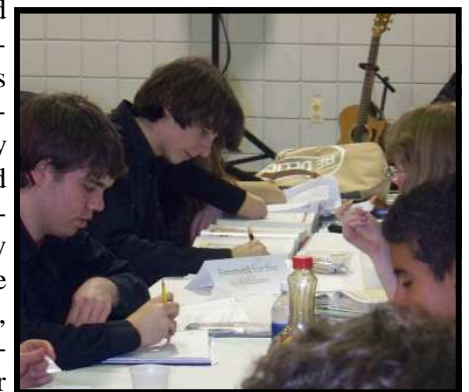
FRS musicians get some homework done prior to a performance.