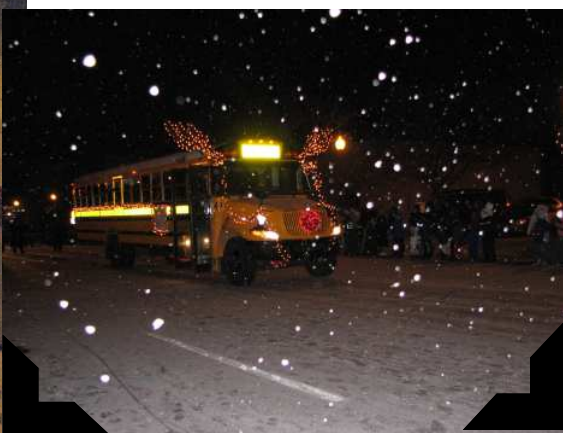
Loved the school bus drivers' decorated "float"! Very clever!