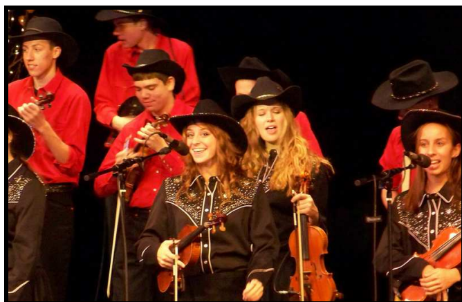
Sing it like you mean it!