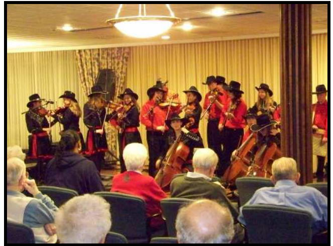
Glacier Hills Retirement Community

Fiddlers ReStrung's holiday spirit emerged in early November. As a prelude to their efforts to bring joy to local children with toys under the Christmas tree, they entertained at Wyandotte Goodfellows' 6 th annual benefit show "No Child Without a Christmas". The East River Folk Society, a Downriver-based nonprofit organization that celebrates the joy of music with monthly, public performances, sponsored the event.